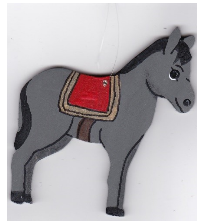
2017 Donkey Ornament